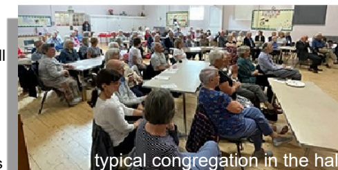
typical congregation in the hall

Please pray that works are completed in time to again host the Legion Remembrance service on Sunday 13 November.